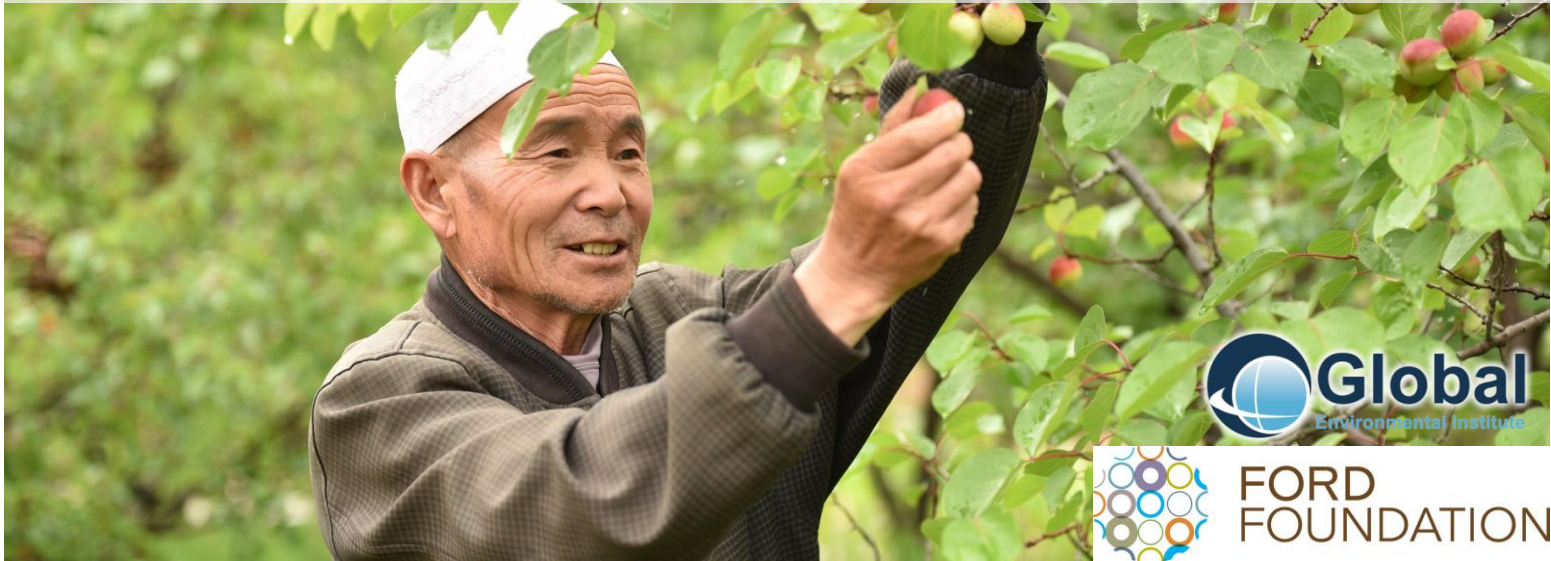
A farmer in Ningxia attends to his new apricot plum trees that will bring fruit and funds – 2015 GEI

In addition to extensive research and policy work in Western China, GEI's Biodiversity Conservation team worked directly with herders, training them to manage and advocate for their own environment. We also opened community development funds utilizing local government aid; these funds secure the projects' longevity. Through this market mechanism philosophy , we help communities develop and achieve sustainable growth.