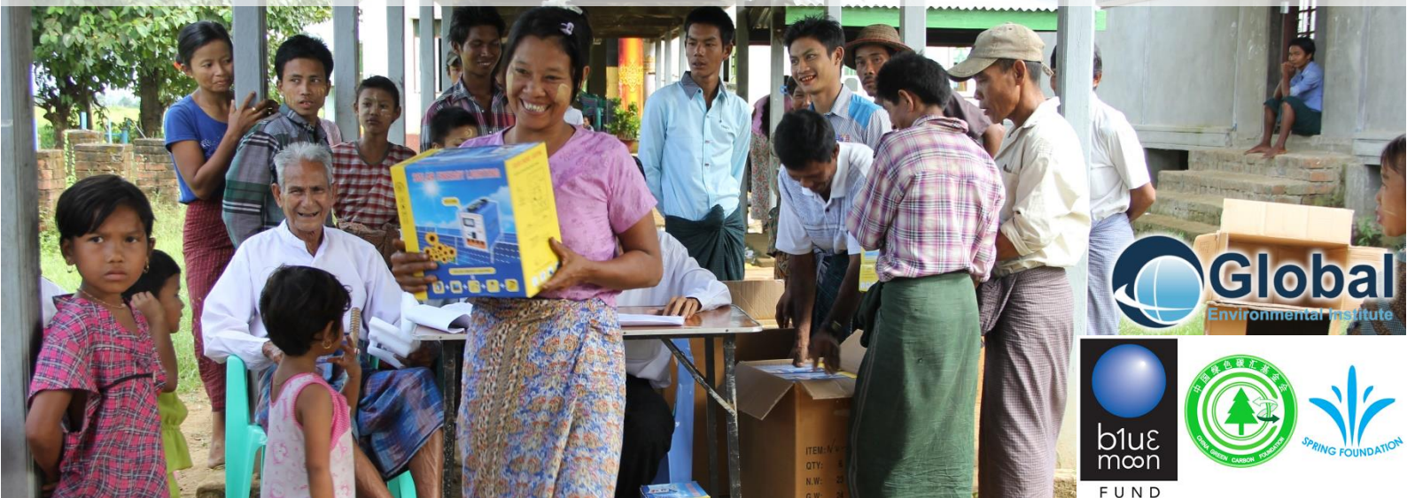
TBK Villagers collect their solar home lights at our special donation ceremony – 2015 GEI